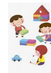
Learning Through Play