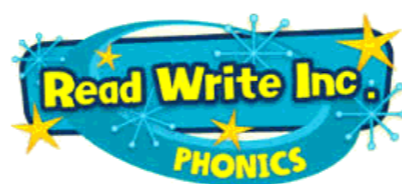
Links to daily phonics sessions